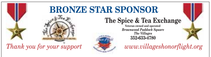
BANNER - MILITARY MEDAL SPONSOR