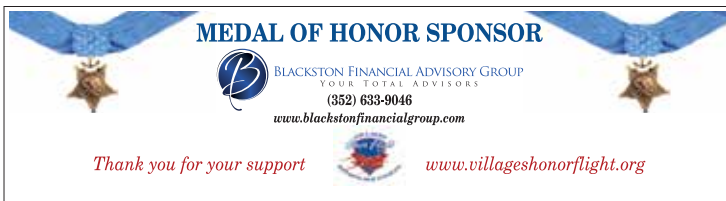
BANNER - MILITARY MEDAL SPONSOR