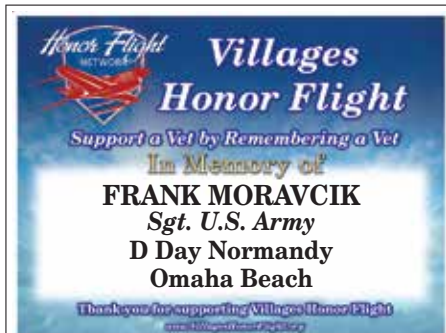
SIGN - IN MEMORY OF (DECEASED VET)