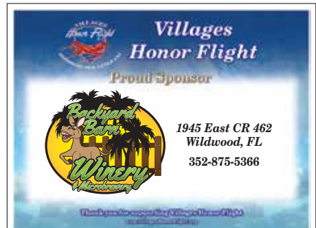
SIGN - CORPORATE WITH OR WITHOUT LOGO